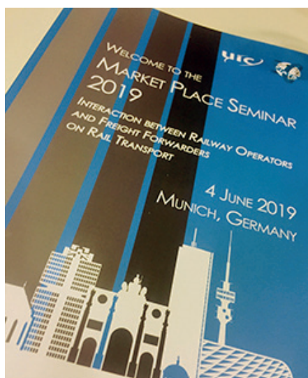
...and was happy with the event's success.