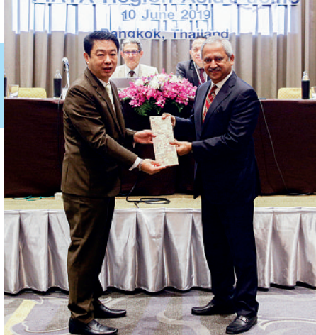
A warm welcome from TIFFA!