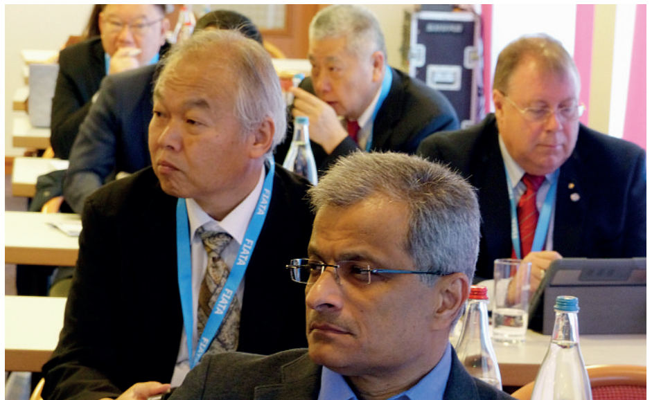
More than thirty delegates were present at this RAP meeting.