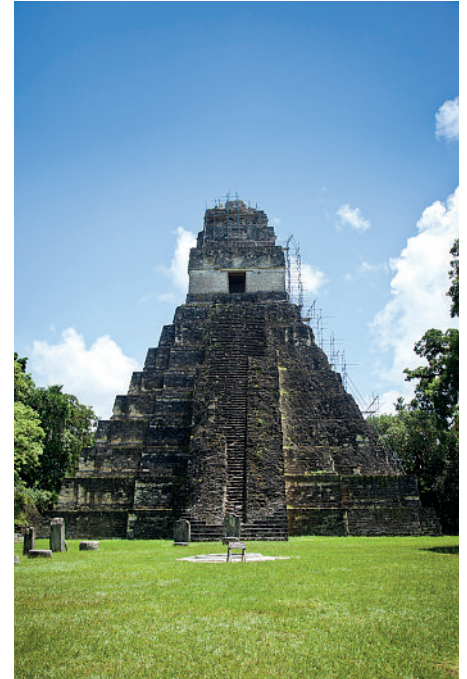
Heritage of the Maya civilisation in Tikal.

footwear, with 13%. Currently, Guatemala exports more than 4,075 different products to more than 140 markets around the world, and has more than 3,946 companies promoting Guatemalan business.