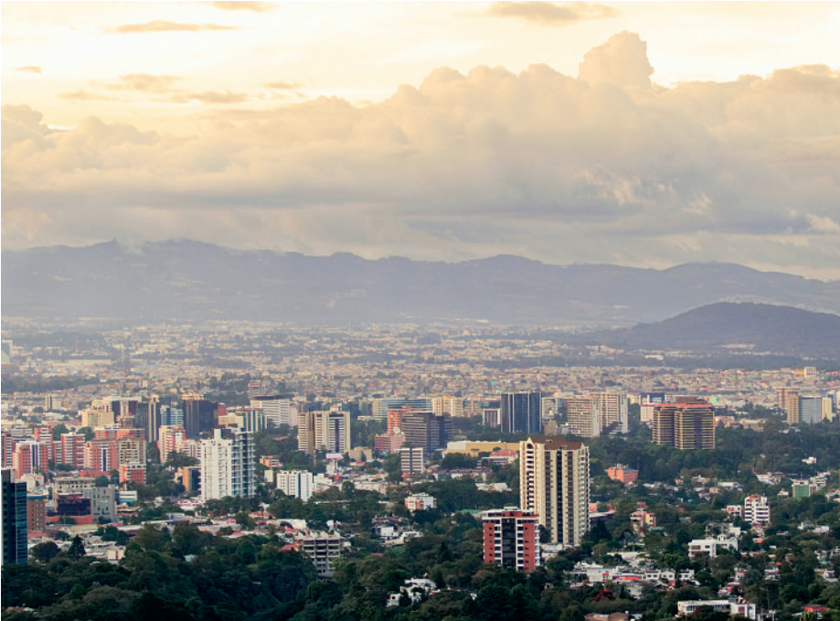
The capital Guatemala City has more than 1 million inhabitants.