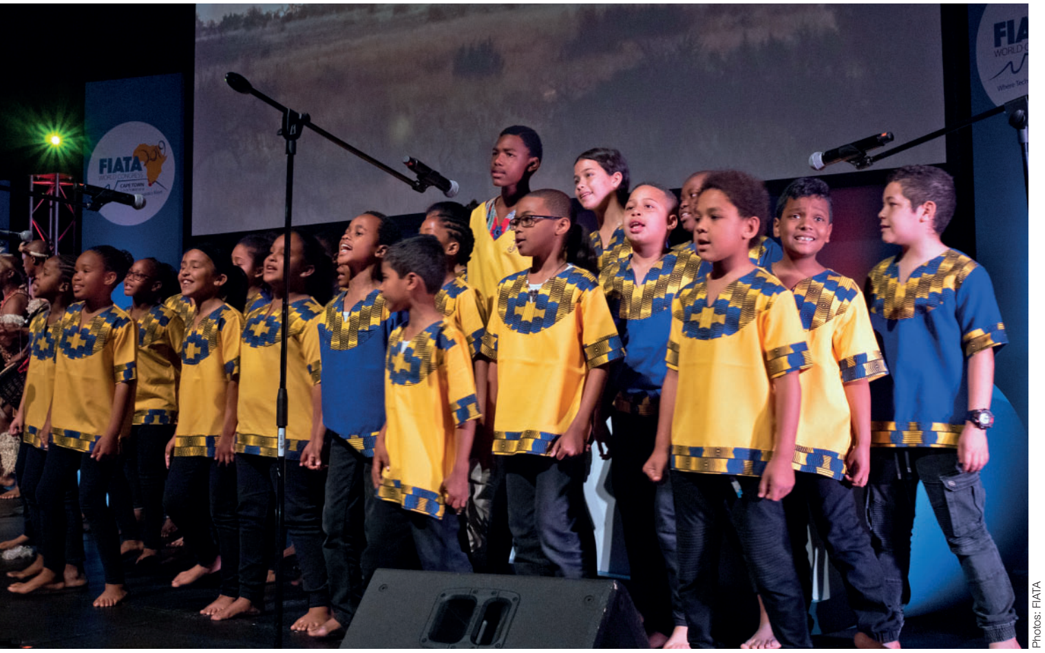
The FWC 2019 opening ceremony in Cape Town took us on a journey into the African world.

Since a definite path to the future is maybe more blurred in today's world than ever before, the need to adapt to disruptions and to manage change has become inevitable. Many a speaker in the CTICC in Cape Town pointed to the impact of new technologies – to the risks, but much more to the opportunities.