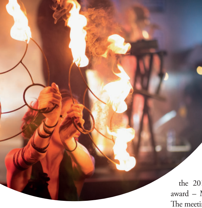
Atmospheric lights and fireworks featured prominently in beautiful South Africa.

Partner, South Africa, gave a presentation on TECHNOLOGY IN LOGISTICS – THEMES AND CUSTOMER EXPECTATIONS.