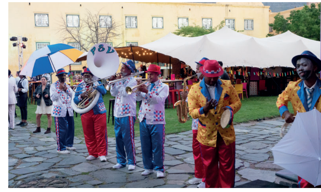
The spirit of Cape Town suffused the sessions.